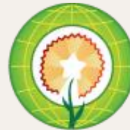
OBEROI INTERNATIONAL SCHOOL