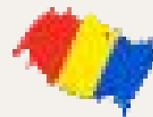
OVERSEAS FAMILY SCHOOL (OFS)