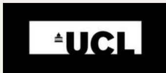
UNIVERSITY COLLEGE LONDON